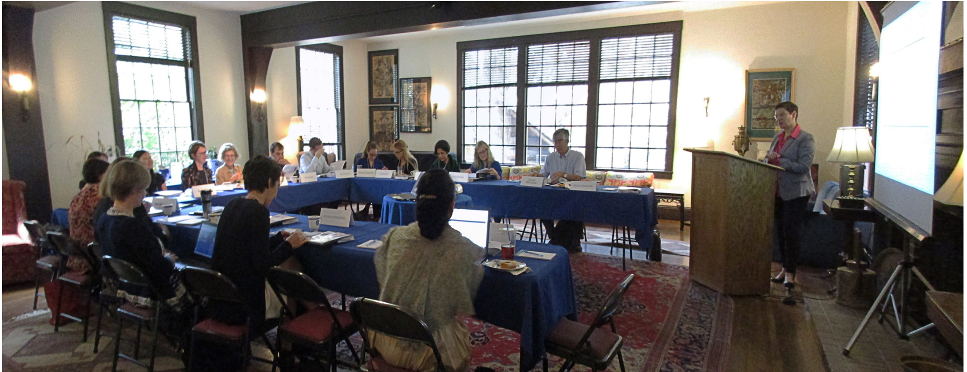
Attendees of the Workshop