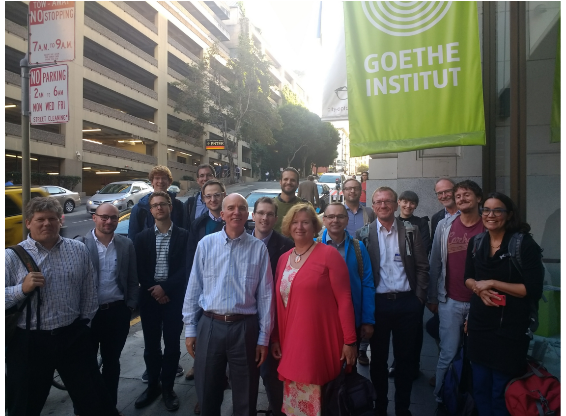
Attendees of the Workshop