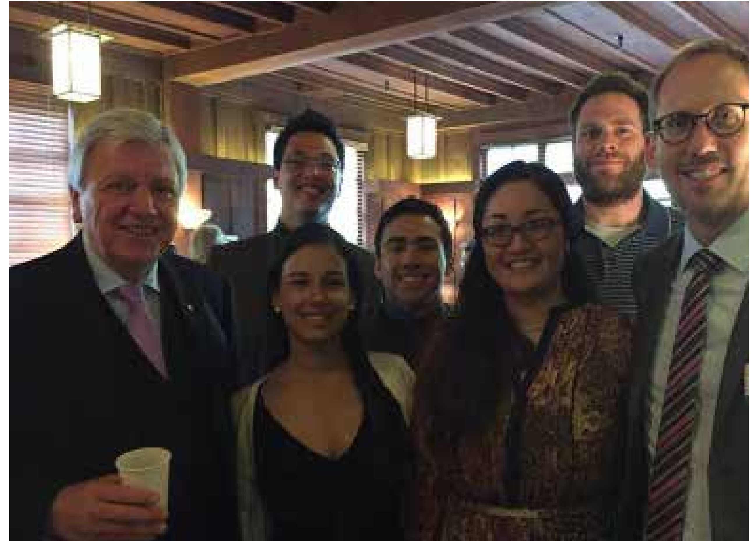
Minister President Bouffier and UC Berkeley and Berkeley City College EU Student Ambassadors