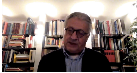
Ambassador Wolfgang Petritsch (President of the Austrian Marshall Plan Foundation)

Transitioning to Yugoslavia and the Balkans, Petritsch outlined a difference between the American concept of identity and the Balkan concept of identity. Namely, there has been a shift of identity from individual to collective.