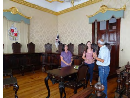
Tour of the City Hall of Angra do Heroísmo, Terceira.

The aim of my research was two-fold: first, I sought to highlight the potential of “home-comers” to introduce change in the Portuguese lexicon through their incorporation of English-origin words. Second, I worked to contribute to Lusophone linguistics and Romance linguistics through attention to an under-researched Portuguese variety. In addition to examining code-switching in narrative performance data on the individual level, I considered the status of a particular category of code-switches—English discourse markers—in Romance and their potential to lose their foreign connotation and become regarded as Portuguese over