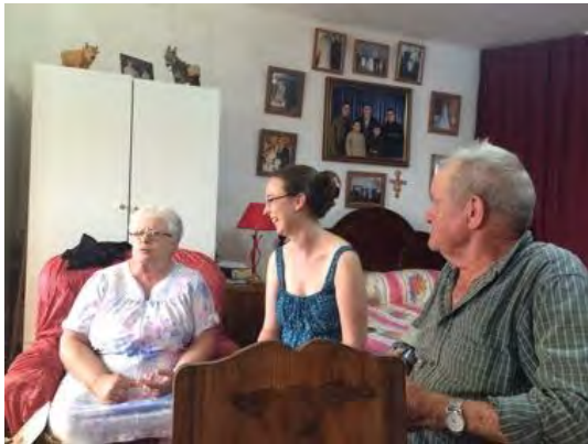
Interview at the home of an Azorean couple in Ribeirinha, Terceira.