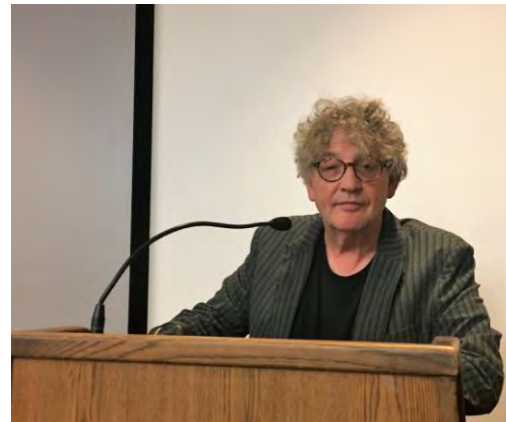
Pulitzer Prize-winner Paul Muldoon

The Irish Studies Program welcomed Pulitzer Prize-winning poet PAUL MULDOON on October 11. The 2017 recipient of Her Majesty's Gold Medal for Poetry, Muldoon was met with a large and excited audience of over 100 that packed the Maude Fife Room in Wheeler Hall. Following an introduction listing his awards and accomplishments as a poet, songwriter, and children's books writer, Muldoon took to the podium and immediately jumped into a recitation of "Meeting the British." Muldoon was engaging, physical, and passionate as he spoke, and provided a clarification of the poem's context – the native Pontiac's Rebellion against the British army – and its relation to early germ warfare. Segueing into the next poem, Muldoon admitted, "I'm making this up as I go along. We'll go on an adventure together and see where it goes." The subject matter of the following poem, "The Coney," paralleled the spontaneity of the evening. He explained that "The Coney" was inspired by one of his dreams, in which he met a rabbit that mistook him for his father. Muldoon's fantastical storytelling had the audience alongside him every step of the way, laughing at its oddities and processing his surreal portrayal of emotional loss, which presented his father's death as a rabbit diving into a pool of wolves. Muldoon also