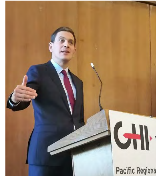
David Miliband (President and CEO of the International Rescue Committee) addresses the audience at Alumni House.

To begin the lecture, Miliband addressed the increasing complexity of the worldwide displacement crisis as a result of new political and economic reasons for people to leave their home countries. Today, one out of every 110 people on the planet is a refugee. Last year, less than two percent of refugees returned home, and sixteen million people were newly displaced. Additionally, roughly half of refugees are children under the age of eighteen. Unlike Europe, where