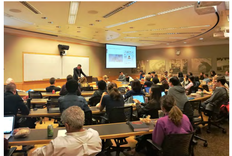
Peter Dabrock (German Ethics Council) addresses the audience at the School of Law

The lecture was followed by a series of questions covering a variety of topics, including different beliefs regarding privacy in the United States and Germany. While Germans generally seem more concerned about privacy issues than most American citizens, Dabrock noted, he also mentioned that the tech companies here in the US appear to be following suit with privacy regulations led by European countries.