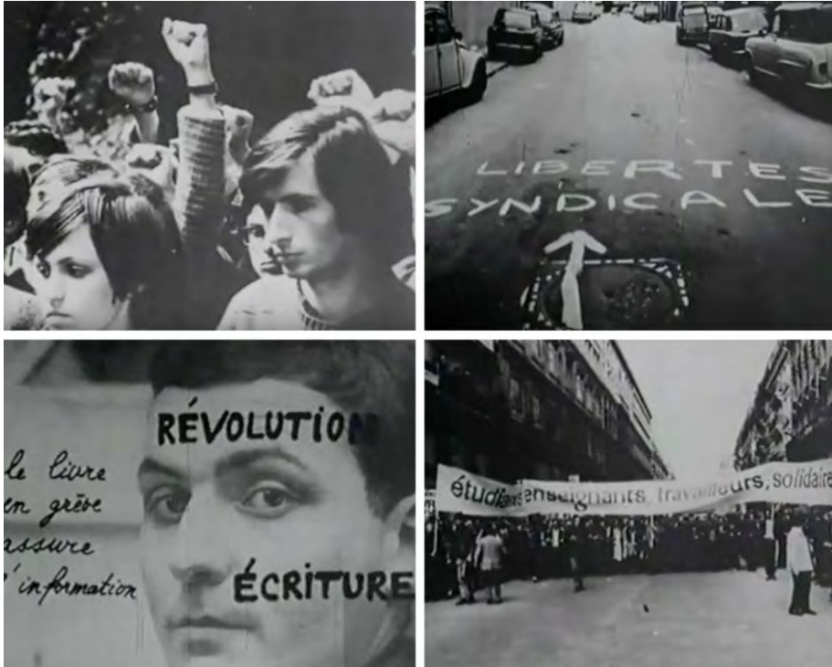
Stills from the Ciné-tracts (France, 1968)